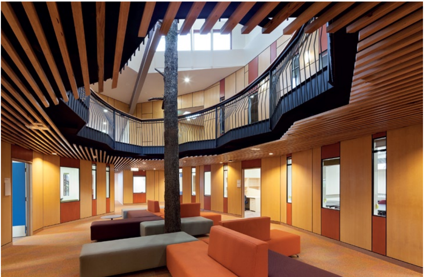
Institute of Koorie Education, Deakin University