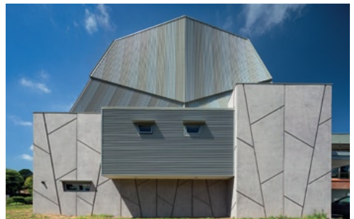
Healesville Memorial Hall Refurbishment