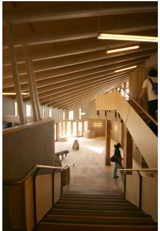
Peninsula Hot Springs Public Bath House