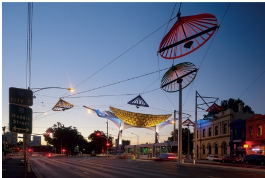
Victoria Street Gateway