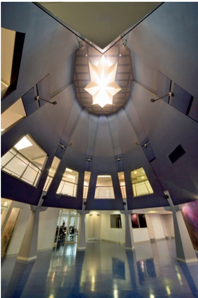
Victorian Space Science Education Centre