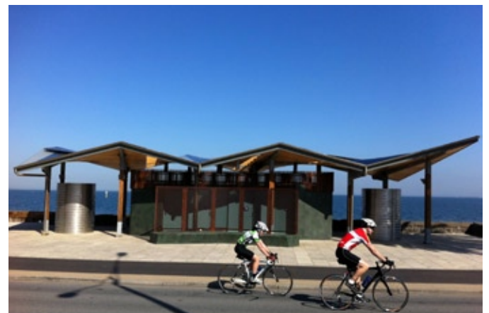
Middle Park Beach Amenities Building