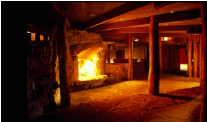
Brambuk Living Cultural Centre