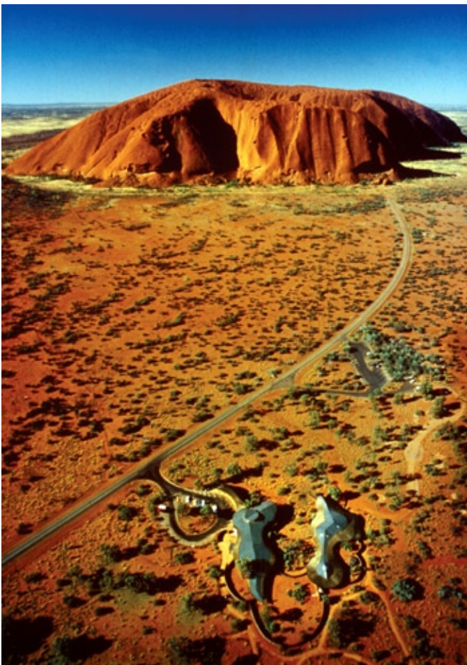
Uluru Kata-Tjuta Cultural Centre