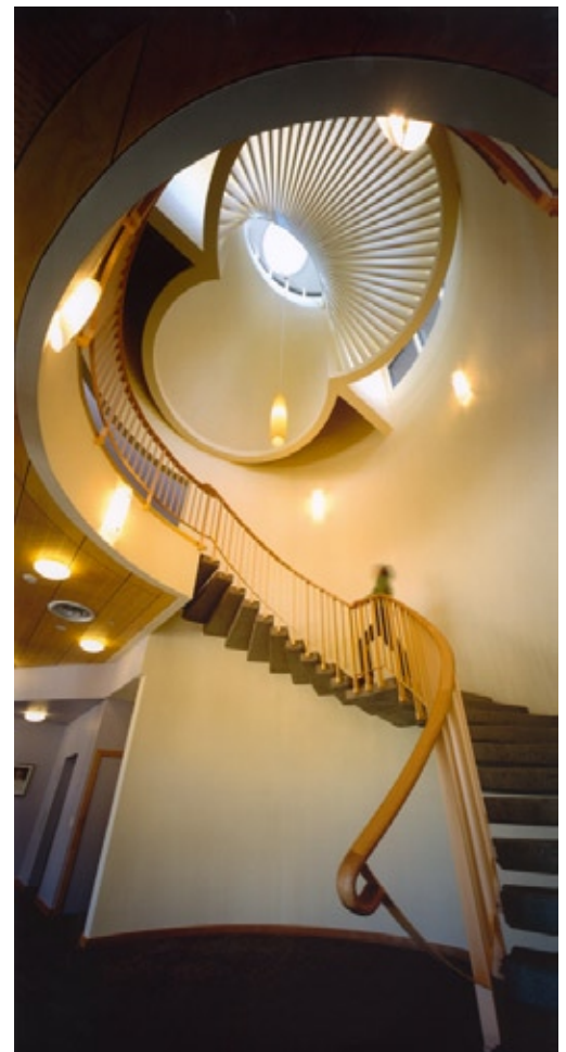
Catholic Theological College